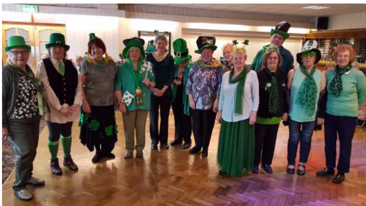
St. Patrick's Fancy Dress Competition at Irlam

We are delighted that Barchester's Charitable Foundation have awarded us a grant of £1,000 to support activities at Little Hulton Healthy Heart Club! Along with tai chi, reiki therapy appointments will now be available at every fortnightly session at Little Hulton for the next 6 months.